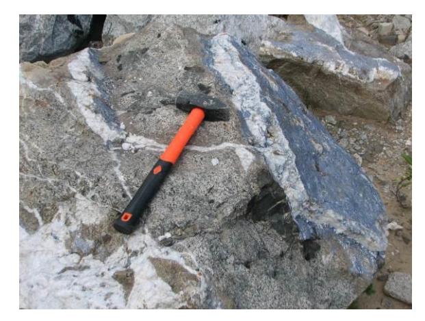
Molybdenite at the Boss Mtn mine, BC